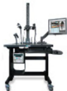
48" Universal Forensic Imaging Workstation

Mideo offers ergonomic hardware configurations designed specifically for individual forensic applications. The Universal Workstation includes microscopes, cameras, articulated arms with cameras, computers and accessories all of which are fully adjustable for the user's comfort and safety. All systems are scalable to enable organizations to implement the solution that fits their needs and budget best.