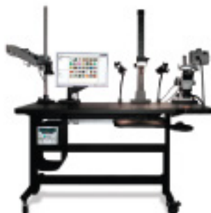
60" Universal Forensic Imaging Workstation

OFFERING EXTENSIVE SOFTWARE & IMAGING SOLUTIONS FOR THE FORENSIC COMMUNITY